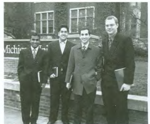
The WSU Model UN Team