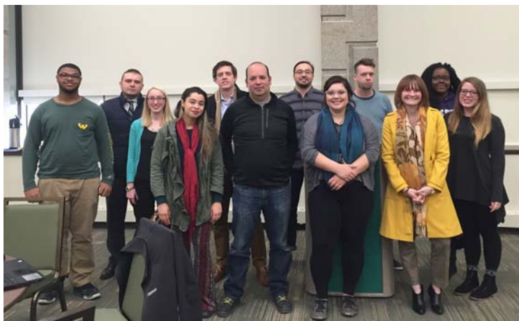
FULD organized a dialogue with members of the Urban Land Institute in April.

Sponsored by the W. K. Kellogg Foundation and the Ford Motor Company Fund, the SEED Wayne Fellowship was successfully piloted this year. Comprising of UP 5430, Cities and Food, and UP 7810, Internship in Community Food Systems Planning, the first round of the fellowship will be completed by four candidates at the end of this summer, with four others potentially completing it in May 2017. Community partners in the internship include the Detroit Black Community Food Security Network, Bandhu (Banglatown) Gardens, Growing Hope (Ypsilanti), and Oakland Avenue Community Gardens. To learn more browse: SEED Wayne.